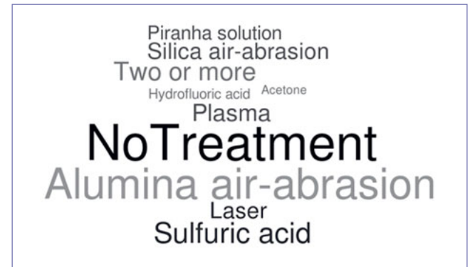
Fig 2 Word Cloud for surface treatments performed by the included studies. Larger and darker words represent the most frequently used treatments. Two or more: combination of different treatments; piranha solution: 98% sulfuric acid + 30% hydrogen peroxide.

The different surface treatments employed in the included studies are illustrated in Fig 2 and described in Table 3. Air abrasion with alumina using different parameters – eg, pressure (0.05 MPa, 0.2 MPa, 0.4 MPa, 2 Bar, 2.8 Bar), time (10 and 15 s), and grain size (45, 50, 110, 120 \mu m) – was the most common treatment for PEEK (19 studies), followed by sulfuric acid etching (11 studies) for different durations (5, 15, 30, 60, 90, 120 and 300 s) and at different concentrations (70%, 80%, 85%, 90%, and 98%), plasma (8 studies), laser (7 studies), tribochemical silica coating (7 studies using different grain sizes, 30 and 110 µm), piranha solution (5 studies), 9.5% hydrofluoric acid (2 studies), and acetone (1 study). The untreated condition (which was usually used as control) was reported in 23 studies. A combination of the mentioned treatments was also reported (9 studies) in evaluating physical/chemical approaches (tribochemical silica coating; alumina-particle air abrasion followed by piranha solution or plasma or laser; sulfuric acid etching + laser treatment). Despite the high heterogeneity of surface treatments explored, all studies were agreed on the importance of surface modification of PEEK to enhance its micromechanical bonding with resin-based materials. Sulfuric acid