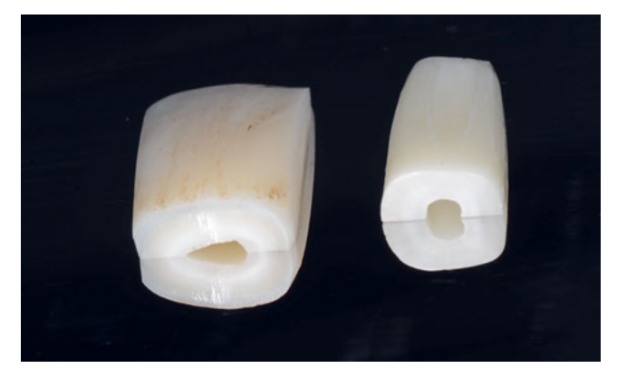
Fig 2 Enamel (left) and dentin (right) specimens.

A brushing sequence began by mixing the slurry and positioning dentin (RDA) or enamel (REA) specimens in the 8-place cross-brushing machine (V-8 Cross Brushing Machine). Standard toothbrushes (Paro M43, Esro; Thalwil, Switzerland) were then fixed in the machine. Using a spring gauge, the force applied by the brushes on the specimens