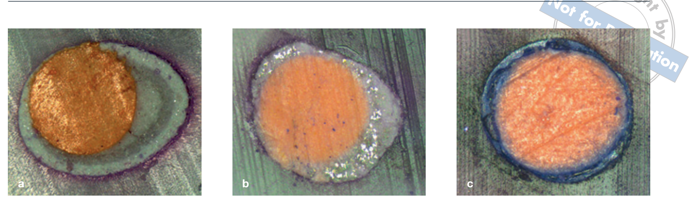
Fig 2 Typical images of dye leakage in the 3 study groups. A tight seal exists between the gutta-percha cone and the sealant in the GP/EWT (a) and the Activ GP (b) groups, with leakages occurring between the sealant and the dentinal walls. The sealant was neither bonded to the gutta-percha cone nor to the dentinal walls in the EndoRez (c) groups, resulting in dye leakages along the dentinal walls and the gutta-percha cone. (Bar length = 100 \mu m )