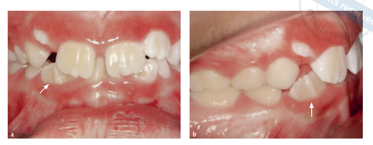
Fig 1 Frontal (a) and lateral (b) photographs showing the clinical situation of the child's dentition. The presence of fused teeth can be observed next to tooth 42 (arrow), which prevents the eruption of tooth 43.

well as for retreatment, surgical endodontics and experimental studies. CBCT allows for 3D inspection in the axial, sagittal and coronal views, in addition to the evaluation of IRR location and size, without anatomical overlaps<sup>3,6,9</sup>.