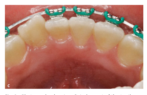
Fig 6 Photographs showing clinical aspect of the tooth 2 years after root canal treatment: (a) frontal, (b) lateral and (c) palatal views.

material (3M Espe, St Paul, MN, USA). Later, the root canal was obturated by the vertical compaction heated gutta-percha technique using Obtura (Sybron Endo, Orange, CA, USA) and Pulp Canal Sealer (Pulp Canal Sealer EWT; Kerr, Orange, CA, USA). The access cavity was sealed with composite resin Filtek Z250 (3M, Sumaré, SP, Brazil). After root canal treatment a postoperative radiograph was taken to verify the root canal filling (Fig 5).