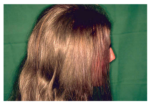
Fig. 9: Manufactured wig in situ. Lateral view. Sufficient cosmetical and functional result.