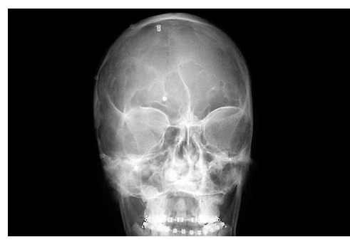
Fig. 4: Radiograph showing the placed titanium implants in the cranium by frontal view.