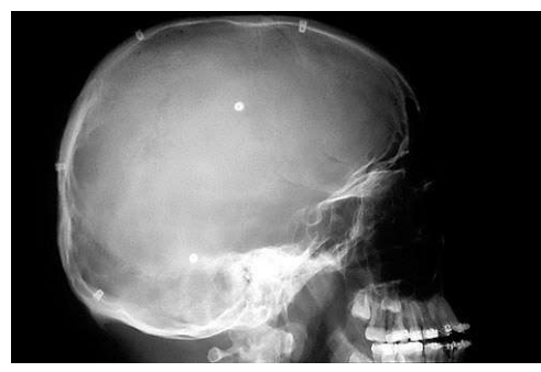
Fig. 5: Radiograph showing the placed titanium implants in the cranium by lateral view.

According to the presurgical analysis fixtures were placed in distance to the hairy / alopecial border in order to reach the best cosmetical result. A total of two implant cavities have not been used as implant sites because of a reduced, unfavorable bone supply. New implant cavities were prepared close to these ones. Primary stability was reached in all implants. All implants were covered with local soft tissue. Commencing one day before stage 1 implant surgery, patients were prescribed 1g amoxicillin three times a day for seven days. Sutures were removed seven days after surgery. During healing period recall was performed in intervals of 4 weeks. No wound disturbencies were observed.