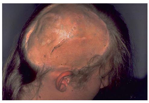
Fig. 2: 17 years old male patient. Status after surgical treatment of lip, alveolar and palate cleft. Status after pilous naevus excision occipital, parietal, temporal and frontal. A split thickness skin graft was used for closing the defect. Alopecial region right. Conventional wig rehabilitation would be unsatisfactory with regard to functionality and cosmetic improvement.

In one patient (male, status after surgical treatment of lip, alveolar and palate cleft, 17 years old) a split thickness skin graft was used for closing a soft tissue defect in the occipital, parietal, temporal and frontal region (defect size approximately 10 \times 33 cm) (Fig. 2).