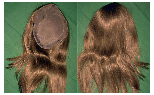
Fig. 8 a/b: Manufactored wig ex situ. In the lower side, metal clips are incorporated which correspond with the magnetic abutments. Due to patients natural long hair likewise long wig hair.