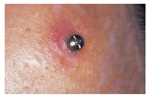
Fig. 6: Status after second stage surgery. Status after healing abutment connection. Peri-implant abutment tissue reaction: mild peri-implant inflammation, slight rubor, slight edema, non-tender (Gitto et al.2 grade 1). Peri-implant abutment tissue contour and attachment: tissue raised around abutment /Gitto et al.2 grade 1).

After a healing period about four weeks and after peri-implant soft tissue management titanium abutments were substituted by titanium magnetics (Fig.7a). The top of the magnetics ranged approximately 1mm above tissue surface. Patients were instructed in implant hygiene. Subsequently a fixture retained wig was constructed (Fig. 7b,8a/b).