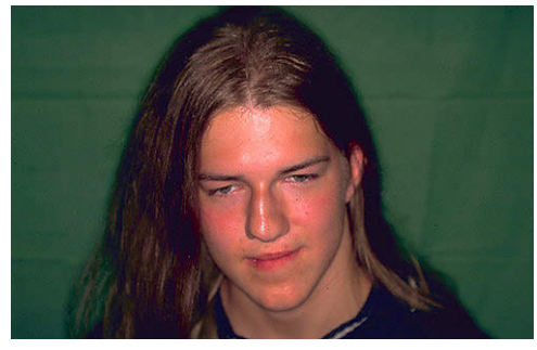
Fig. 10: Manufactured wig in situ. Frontal view. Sufficient cosmetical and functional result.

Wigs are even worn by sport activities and swimming.