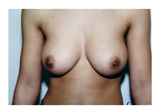
Fig. 4 Sexual maturity: Mammae fully developed, papillae pigmented