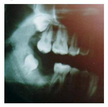
Fig.8 OPG of the right molars. Tooth 47 is missing.