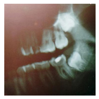
Fig.9 OPG of the left molars.