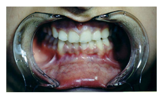
Fig.7 Jaws in occlusion

\cdot Oral examination including dental status and OPG