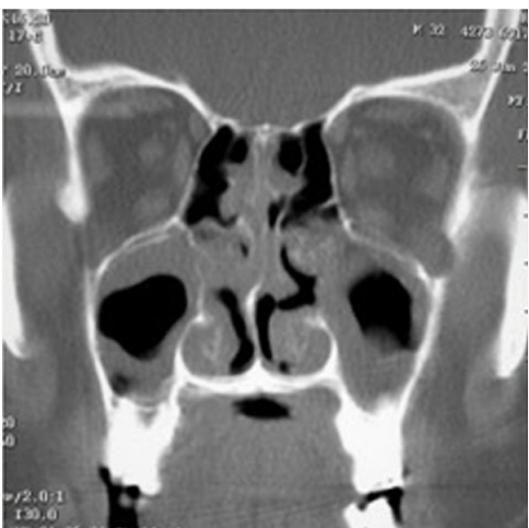
Fig 5: CT scan showing thickening of the sinus lining of soft tissue density (axial view) sinus lining of soft tissue density (coronal view)