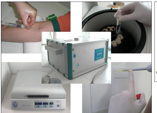
Fig. 1: Processing of samples

ESR was tested blinded to the clinical data. Peripheral blood was isolated from 32 patients with histological verified OSCC (m=18, w=14; T1 n=11, T2 n=10, T3 n=6, T4 n=5; N0 n=24, N1 n=6) and tested against 30 healthy volunteers (age and gender matched). A discriminant variable (DR) was calculated. Obtained data were associated with pathological and clinical data.