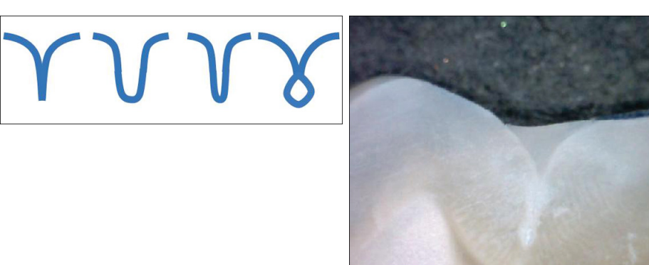
Fig. 5: Fissure configuration: V-, U-, I- and Fig. 6: Score 0 = no dye penetration IK-Type.

Statistical analysis was performed using SPSS 18.0.