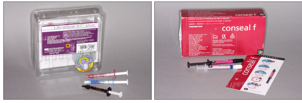
Fig. 1-2: Fissure sealants Ultraseal XT (Ultradent) and Conseal f (SDI) used in this investigation

The aim of this study was to evaluate the microleakage of four fissure sealants (Ultraseal XT, Conseal f, Smartseal&loc F and Delton) in relationship to fissure configuration after artificial aging.