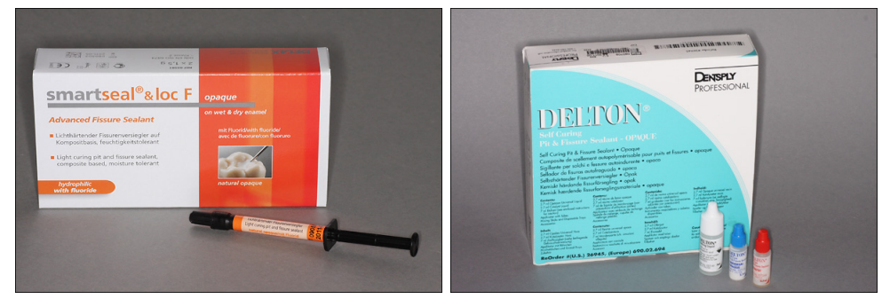
Fig. 3-4: Fissure sealants Smartseal&loc F (Detax) and Delton (Dentsply) used in this investigation