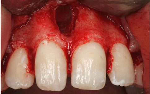
Fig. 1 Fig. 2