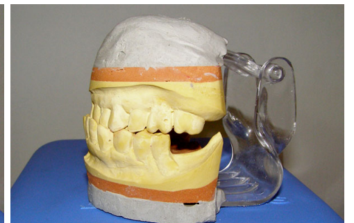
Fig. 5 Fig. 6