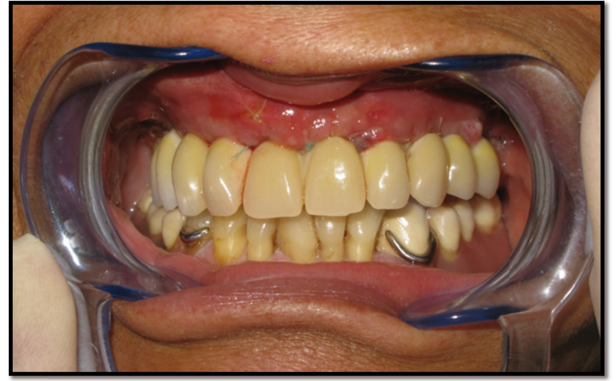
Fig. 3 Smile after 1 week from surgery