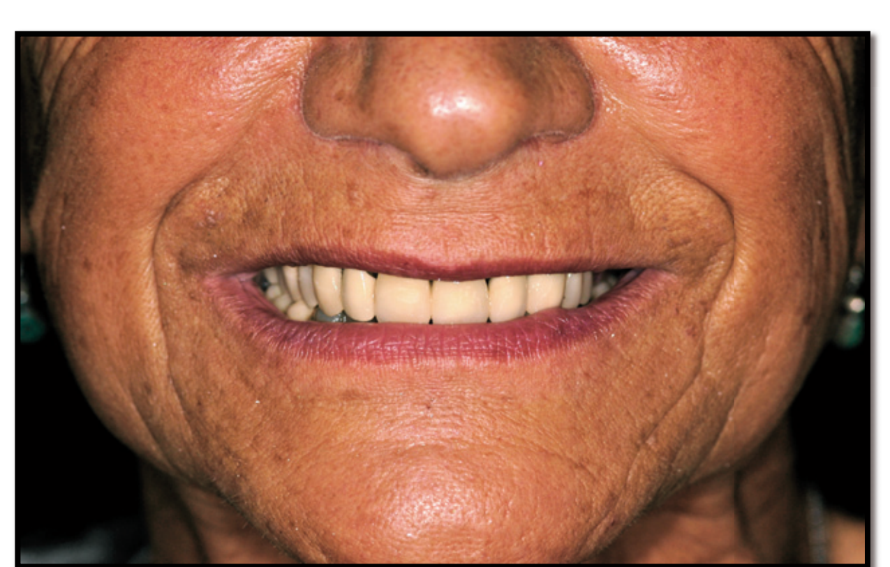
Fig. 1 Presurgical smile