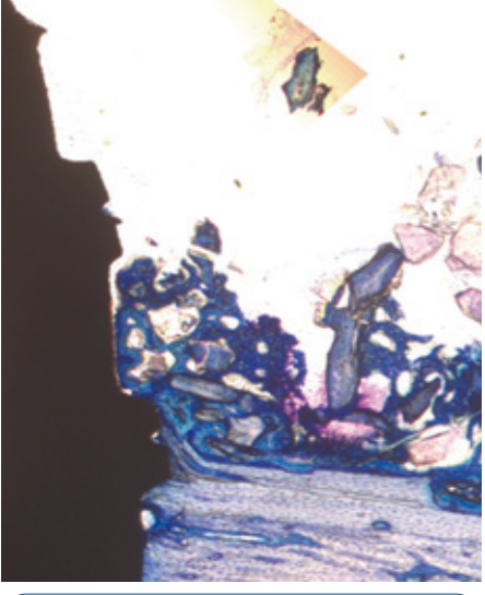
Figure 3: Representative histological specimen of the DBB+membrane+rhPDGF group after 6 weeks.