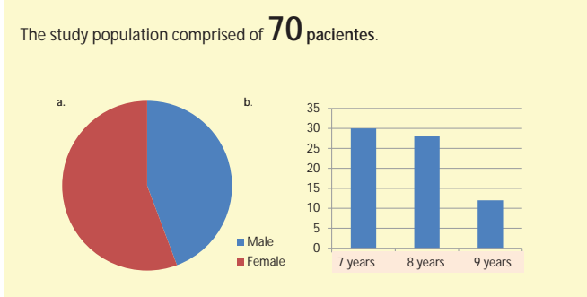
Fig.1. a. Distribution by gender groups; b. Distribution by ages group (n=70)