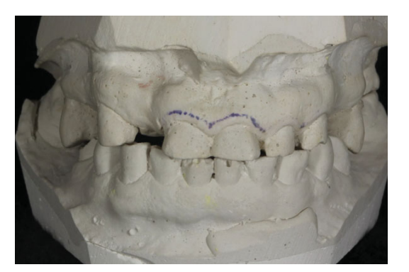
Fig. 3 – Study casts for planning a rehabilitation with VDO increase