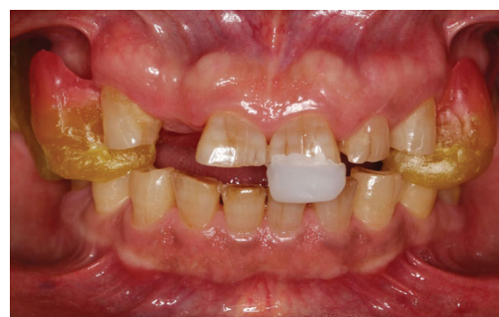
Fig. 4 – Registration of VDO increase in mouth to transfer to study casts