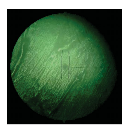
Figure 2. Observed image taken during Vickers surface microhardness