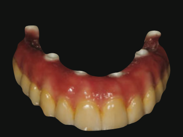
Fig. 11- Upper prostheses