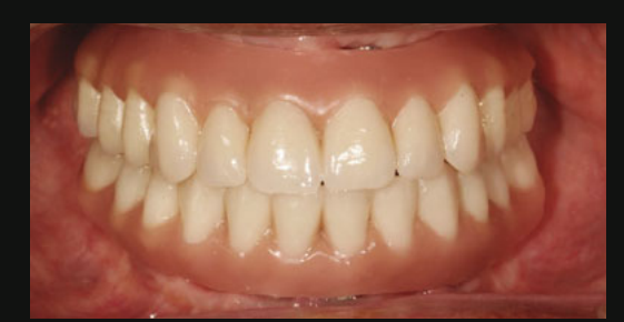
Fig. 4 - Esthetic try-in