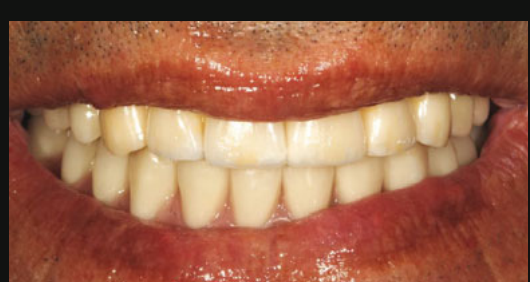
Fig. 9 - Smile with definitive prostheses