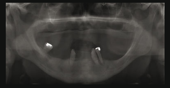
Fig. 1 - Inicial photos a) Inicial panoramic X-ray

6 implants were performed in the upper jaw and 4 implants in the lower jaw with immediate load (all of them Branemark System MkIV 4X15mm). The upper posteriors implants, due to poor primary stability, were loaded after the osseointegration period.