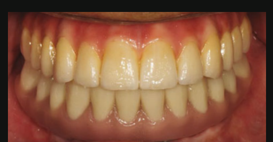
Fig. 5 - Ceramic try-in