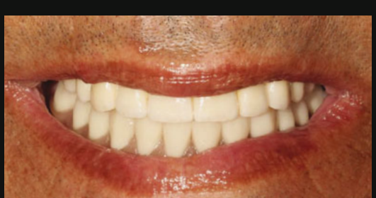
Fig. 6 - Ceramic try-in (smile)