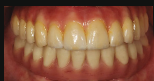
Fig. 10- Definitive prostheses (intra-oral)