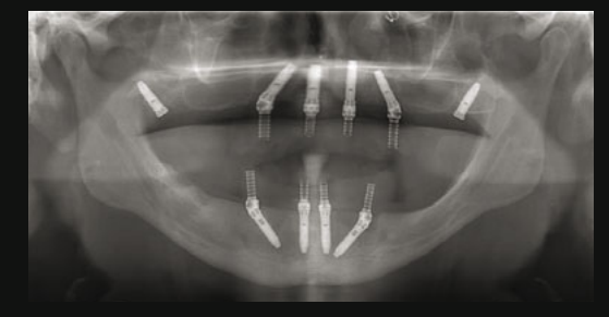
c) Immediate function X-ray

DISCUSSION: The loss of teeth promotes bone resorption at the level of the jaw, A implant-supported full rehabilitation allows the placement of implants and respective immediate loading. Because of being a simple surgical technique and prosthetic, and have a high success rate, the complete implant rehabilitation is increasingly used.