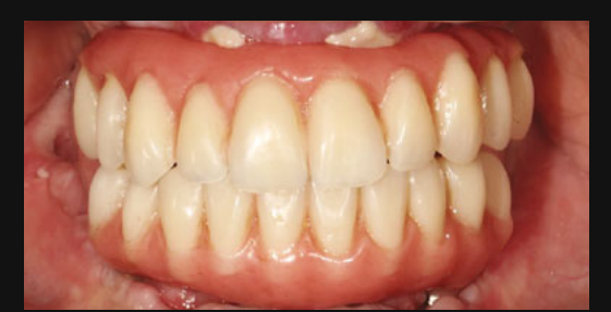
Fig. 2 - Provisional prostheses 10 days after surgery

DISCUSSION: The loss of teeth promotes bone resorption at the level of the jaw, A implant-supported full rehabilitation allows the placement of implants and respective immediate loading. Because of being a simple surgical technique and prosthetic, and have a high success rate, the complete implant rehabilitation is increasingly used.