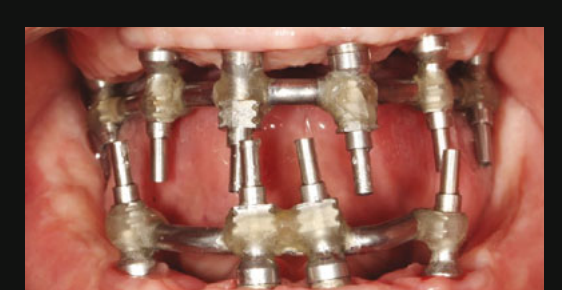
Fig. 3 - Final ipression