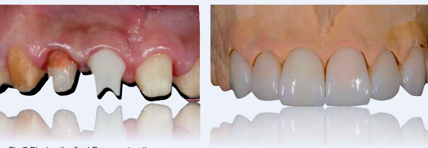
Fig.7 Placing the final Emax restorations