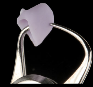
Fig. 10 - Crown after milling with 1.6 mm thickness

Fig. 9 - Anatomy and points of contact adjustment