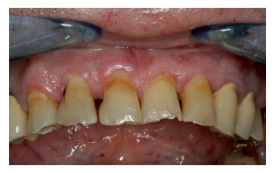
Fig. 3 Front teeth from an hospitalized 63 years old male patient with signs of erosion and oral lesions