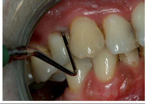
Fig. 2 Measuring of pocket probing depth in an 48 years old female patient