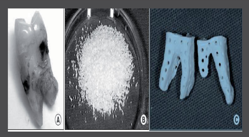
Figure 2 – Extracted tooth ready to be fabricated into AutoBT in either powder or block form. B. AutoBT powder. C. AutoBT block form