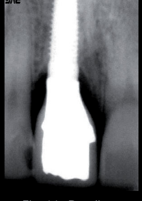
Fig. 14- Baseline periapical radiography on the day of the implant placement

As the buccal plate was intact, an immediate implant with an immediate provisional crown to keep allowed an adequate gingival margin with a correct papilla position. A follow-up period of 4 years shows good aesthetics with stable hard and soft tissues.