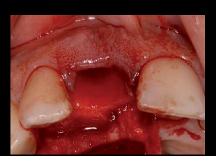
Fig. 4 - Flapless atraumatic extraction of 11