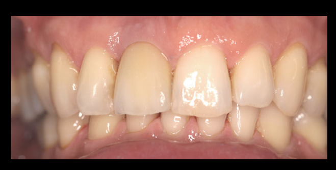
Fig. 16 - Final zirconia crown 4 years after surgery - front view