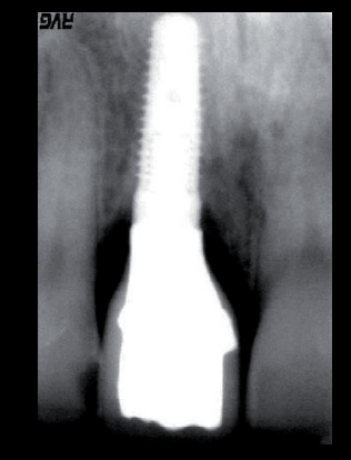
Fig. 15 - Periapical radiography 4 years after implant placement