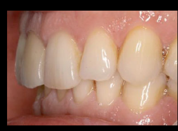
Fig. 11- Final zirconia crown 6 months after surgery lateral view ( left side )