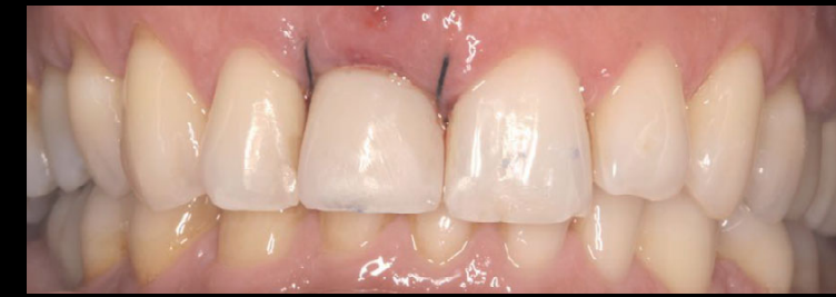
Fig. 8- Provisional acrylic crown on the day of the implant placement