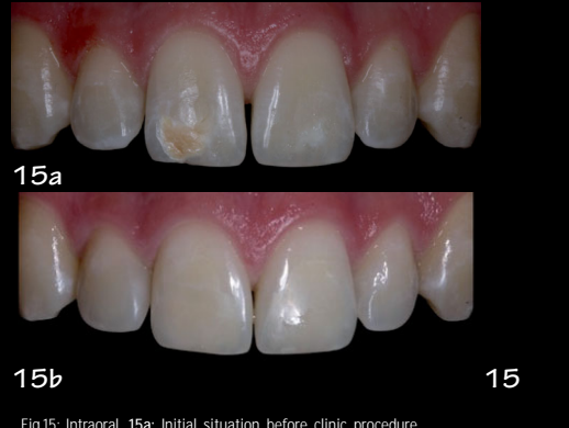
Fig.15: Intraoral. 15a: Initial situation before clinic procedure 15b: Final situation after clinic procedure