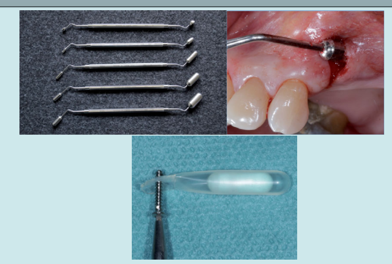
Figure 1 . Surgical templates to choose the expander and prepare the surgical site. Flat end of the expander is fixed to the underlying bone with a screw.

From the pool of patients attending the Dental Clinic of the Ospedale Maggiore Policlinico, University of Milan, Milan, Italy, four participants requiring alveolar bone augmentation and dental implant placement were included in this clinical investigation. Soft tissue expanders were implanted in subperiosteal pouch as previously described [3]. After reaching their final volume, expanders were removed followed by vertical and/or horizontal bone augmentation. Tension-free primary closure was achieved in all cases without utilizing deep periosteal and/or vertical releasing incisions. Dental implants were placed 6 months following bone augmentation. Cone beam computed tomography (CBCT) scans were taken for all patients, before placement of soft tissue expanders and 4-6 months following bone augmentation procedures. Soon after dental implant placement intraoral or panoramic radiographs were taken. Vertical and horizontal bone gains were calculated on CBCT scans, as previously described [1] and volumetric analysis of soft tissue gain was done by optic scanning, as previously described but with some modifications [5, 6]. Materials & methods are seen from figure (1) to figure (3).