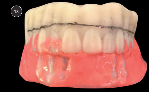
Fig. 10- Try-In impression to improve the lower prothesis' accomodation to the lower alveolar ridge