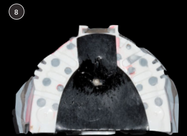
Fig. 8- Marking of the C.R. point in the Gothic arch