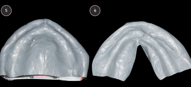
Fig. 5/6- Upper and lower definitive impressions, respectively