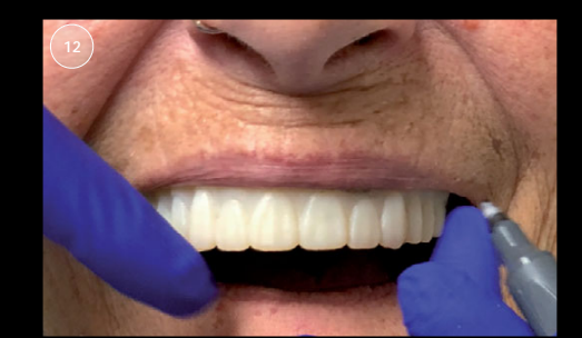
Fig. 9- Try-In placed in the mouth