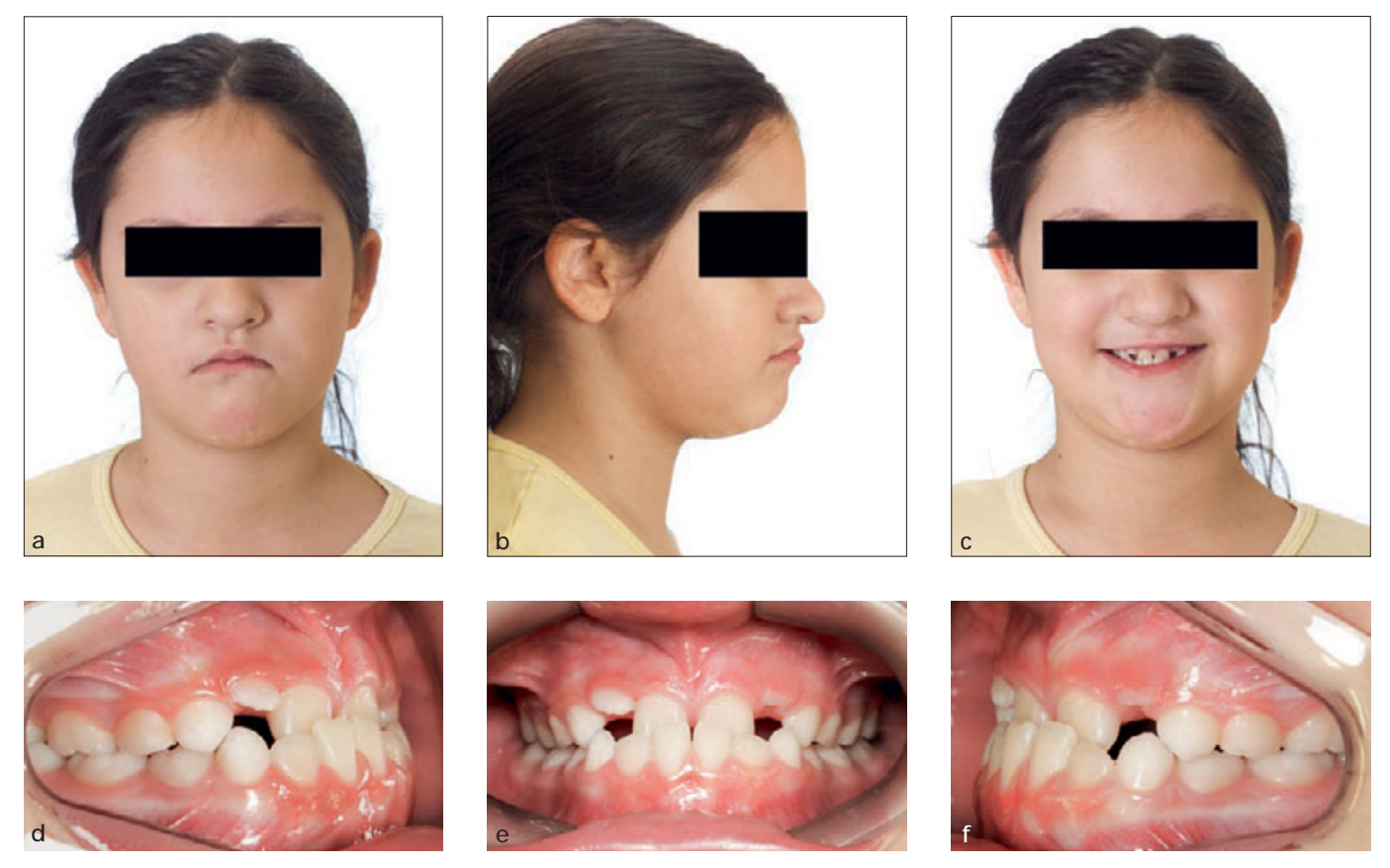
Figs 1a-f Pretreatment facial and intraoral photographs taken with the mandible in maximal intercuspation.

appliances were devised to intercept the malocclusion at an early stage, thus re-establishing the normal development of the dentition.