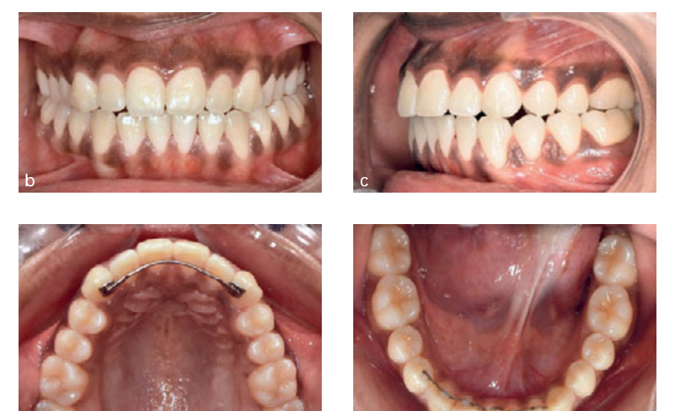
Figs 1a-e Intraoral photographs showing the broken mandibular fixed retainer in relation to the central mandibular incisors and the resulting relapse in mandibular incisor alignment.

cut and adjusted to provide relief from the impingement. On clinical examination, the mandibular left central and lateral incisors and right lateral incisors showed mesiopalatal rotation and the right central incisor was labially positioned. The options to correct the relapse of mandibular incisor alignment using either fixed appliances or aligners were explained to the patient and her mother. After discussing the advantages and disadvantages of both appliances and the precautions required for follow-up during the COVID-19 pandemic, a joint decision was made to use aligner therapy to correct the relapse. Due to the pandemic situation, certain modifications were made to the digital plan and the complete in-house laboratory workflow to fabricate the aligners, which made the present case unique when compared to a previously published report using commercially available clear aligners<sup>13</sup>.