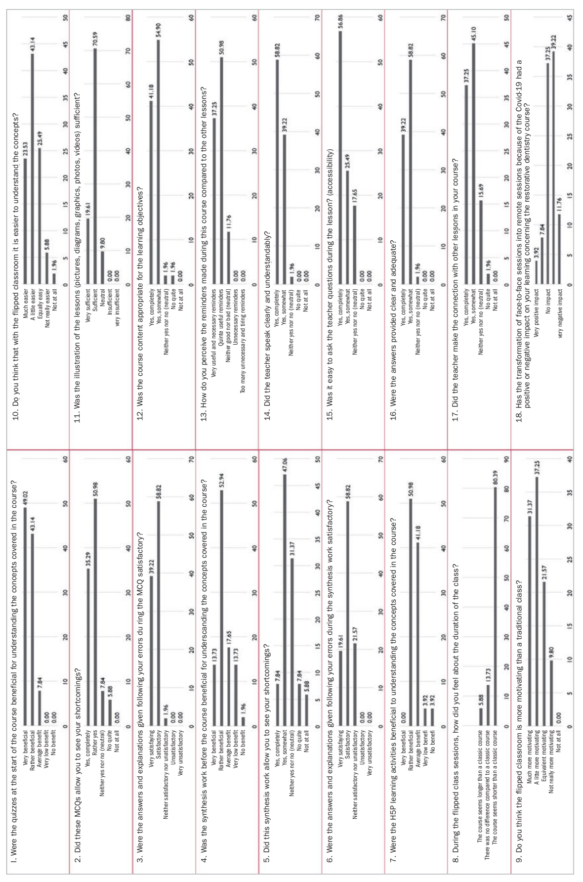
Fig 2 Graphical representation of the students, answers to the satisfaction questionnaire (in %).