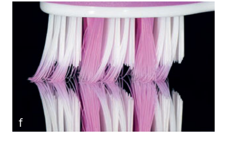
Fig 2 Images of the standard medium toothbrush Paro M43 (a–c) and the anti-erosive toothbrush Elmex Erosion Soft (d–f) from different angles. (c) and (f) show the deformation of the bristles under load (200 g).