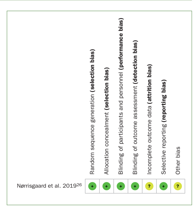
Fig 2 Risk of bias analysis of randomised controlled trials.<sup>14</sup> (+): low risk of bias; (-): high risk of bias; (?): unclear risk of bias.

Regarding the association between vitamin D levels in children and their caries experience in permanent dentition, Kühnisch et al<sup>23</sup> verified that higher vitamin D levels were associated with less caries in permanent but not in primary teeth; however, caries evaluation was not the main objective of that study. More recently, Kim et al<sup>21</sup> found that the group with higher levels of vitamin D had a lower proportion of children with caries experience, particularly regarding the permanent first molars. Those authors found that, after adjusting the variables sex, age, household income, and