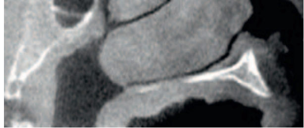
Fig 2 A Cone Beam CT scanning revealed a lesion in left side of hard palate with focal bony destruction. A) Coronal plane. B) Sagittal plane

a dense lymphoid stroma<sup>1,4,5</sup>. Undifferentiated carcinomas of salivary glands are a group of uncommon malignant epithelial neoplasms that lack the specific lightmicroscopic morphological features of other types of salivary gland carcinomas. These carcinomas are similar histologically to undifferentiated carcinomas that arise in other organs and tissues. According to the 1991 World Health Organization (WHO) classification of salivary gland tumours, LEC is classified as undifferentiated carcinoma of the salivary gland. As a variant of undifferentiated carcinoma, it is distinguished from small cell and large cell undifferentiated carcinoma by its association with benign lymphoepithelial lesions<sup>2,3</sup>. But according to the 2005 WHO classification, LEC is de-