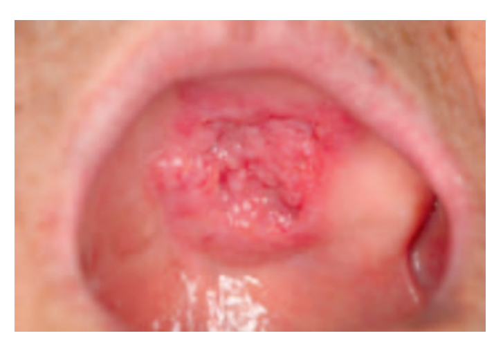
Fig 1 A large, deep, red, mucosal ulceration was present in the posterior hard palate at the junction of hard-soft palate.