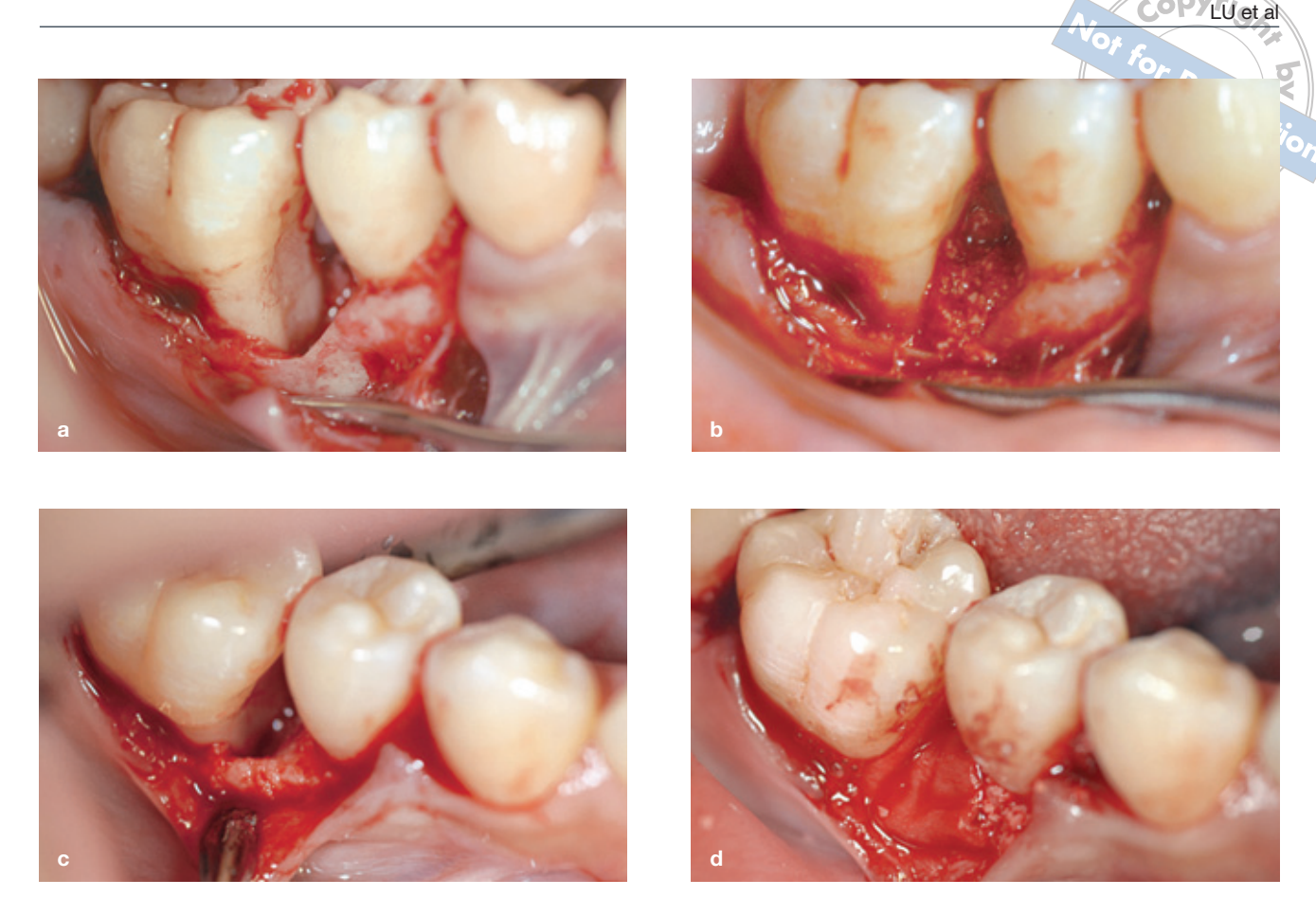
Fig 4 a) Clinical intrasurgical view of the right mandibular first molar. b) The mesial intrabony defect was filled with Bio-Oss Collagen. c) Clinical intrasurgical view at second surgical therapy (6 months after the first bone graft surgery). The mesial intrabony defect, which was narrower and shallower than at the first surgery (a), was filled with Bio-Oss and covered by Bio-Gide membrane (d).