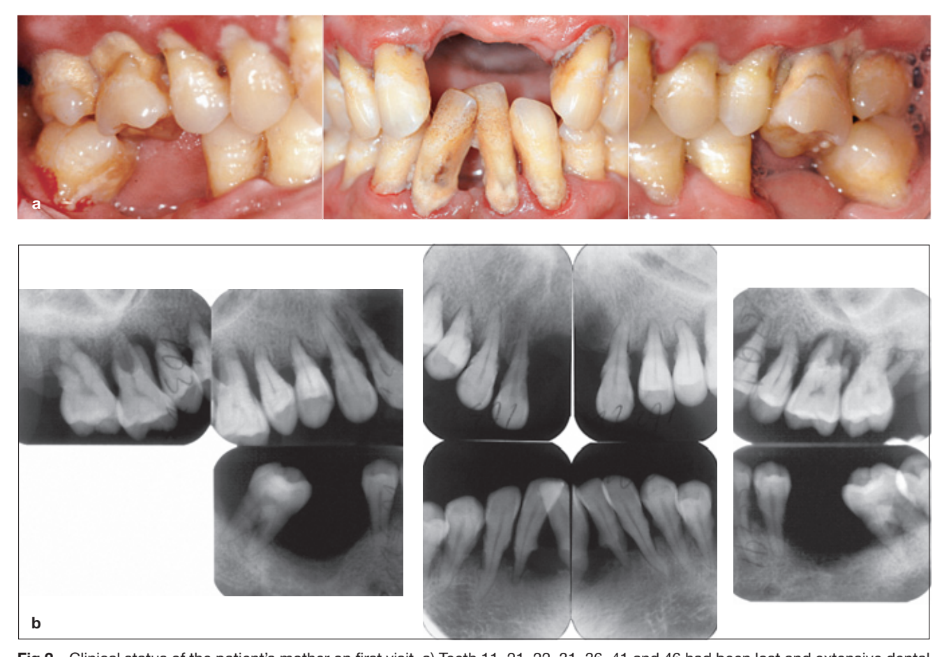
Fig 2 Clinical status of the patient's mother on first visit. a) Teeth 11, 21, 22, 31, 36, 41 and 46 had been lost and extensive dental calculus and gingival recession were observed. Clinical examination revealed severe attachment loss. b) Full-mouth periapical radiographs at initial examination revealed severe horizontal bone loss to the apical third of the root length. The prognosis for most of the teeth was hopeless.