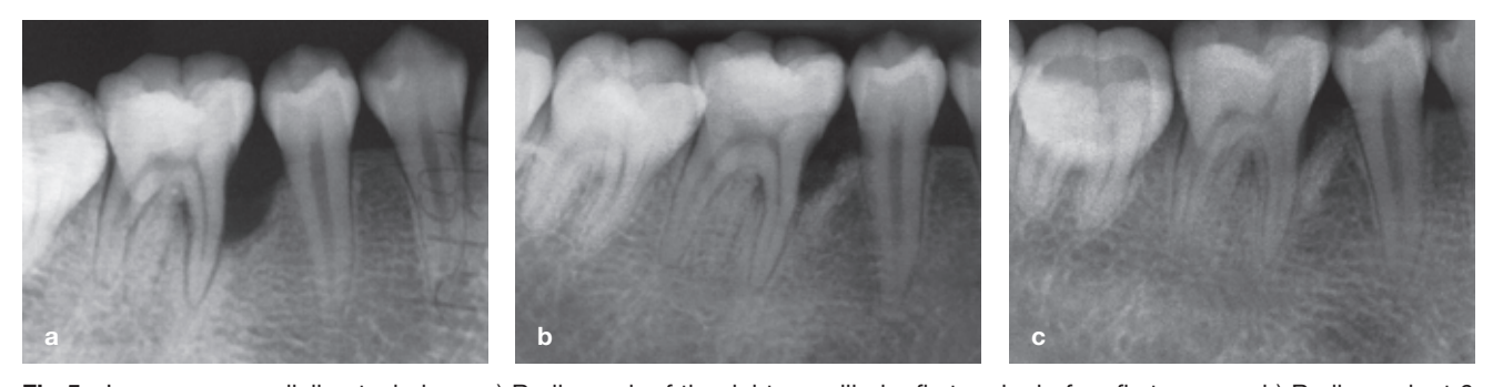
Fig 5 Long-cone paralleling technique. a) Radiograph of the right mandibular first molar before first surgery. b) Radiograph at 6 months after the first surgical bone graft procedure. c) Radiograph at 6 months after the second surgical bone graft and GTR procedure. Compared with the original situation (a), pronounced new bone formation mesial of the tooth can be observed.

2 months after periodontal initial therapy. Polymerase chain reaction amplification of Porphyromonas gingivali ( Pg ), Tannerella forsythia ( Tf ), Treponema denticola ( Td ) and Aggregatibacter actinomycetemcomitans ( Aa ) was performed in the samples of GCF from the