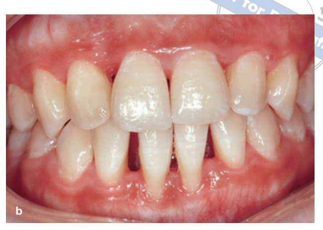
Fig 1 a) Clinical front view of the patient at initial examination, showing intense inflammation and oedema of the gingiva and extensive plaque and dental calculus. b) Clinical front view of the patient at 4 years after periodontal treatment, showing that the periodontal inflammation was significantly reduced and gingival recession in the mandibular incisors.