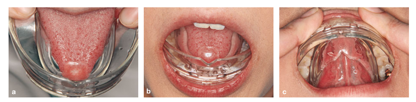
Fig 5 Resting tongue position while using the T4A.