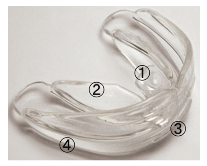
Fig 3 Structure of the T4A. 1) Tongue tag: for active tongue training; 2) Tongue guard: prevents tongue-thrusting; 3) Lip bumper: reduces activation of the mentalis muscle; 4) Wing-like base: relaxes the temporomandibular joint.