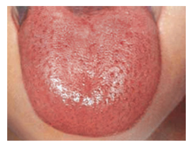
Fig 4 Just before the wearing of the T4A.

The study showed the state of the tongue before adding T4A to a patient (Fig 4). The structure of the T4A facilitates improvement of various oral habits (Fig 5) Cheek muscle pressure is reduced by closing the lips for 1 h with the T4A in the mouth, and natural nasal breathing is promoted by using the T4A during sleep (Fig 6). For patients using an edgewise appliance, oral habit training can be performed in combination with the T4B.