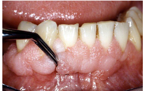
Figure 1: Vestibular view of the mandible,

Clinical Findings: The lower jaw showed pronounced irregular granular (cauliflower-like) growth with a cleft surface between the first mandibular premolars on both sides (Figs. 1 and 2). Solitary papules approximately 6 mm in size were found on the edentulous alveolar ridge in the region of the right mandibular first molar, on the mucosa of the lower lip, and on the vestibular papilla in the region of the right maxillary lateral incisor.