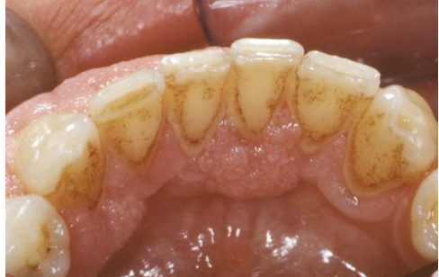
Figure 2: Lingual view of the mandible