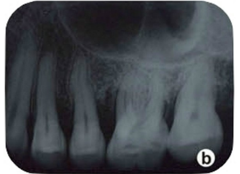
Fig. 2 Case B - Rx image before treatment (a) Fig. 2 Case B - Rx image six months after (b)