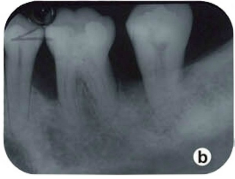
Fig.1 Case A - Rx image six months after (b)