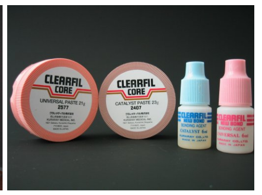
Fig. 5: Materials used in group A: The dentin adhesive Clearfil New Bond and the corresponding self-curing composite Clearfil Core.