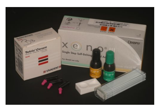
Fig. 6: Materials used in group B: The dentin Fig. 7: The adhesive Xeno III and the light-curing composite material Tetric Ceram (colour A2). Gluma Desensitizer