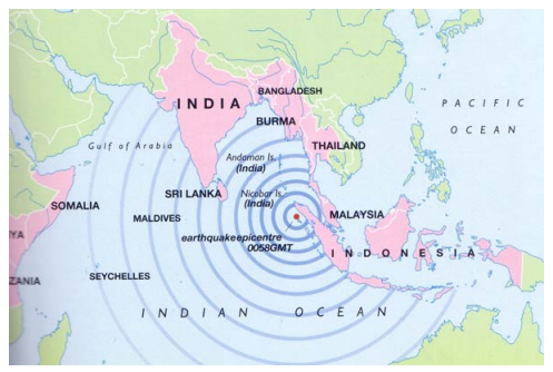
Fig. 2: The incredible power of the Tsunami was felt in countries across the 4,500 kilometre-wide Indian Ocean