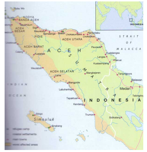
Fig. 3: Banda Aceh felt the tremors with greater force than any other built-up area: Banda Aceh was the nearest large city of the epicentre of the massive undersea earthquake