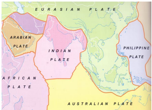
Fig. 1: The earth's surface is made up of a series of plates. When they suddenly move together, an earthquake occurs

However in December 2004 the Indian Ocean had no such warning facility, partly because the governments of the Indian Ocean nations could not afford it but also because it was not deemed necessary. Historically, the Pacific had always been at far greater risk from tsunamis.