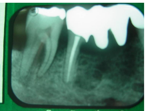
Fig. 5 Tooth 38