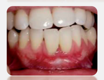
Fig. 11: Control 15 months (photo sent by the patient in isolation by Covid-19)