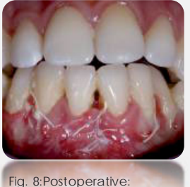
Fig. 8:Postoperative: Suture removal 12 days