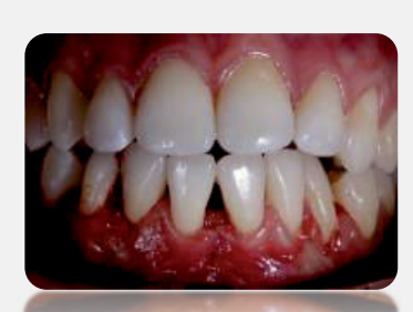
Fig. 9: Control 1 month