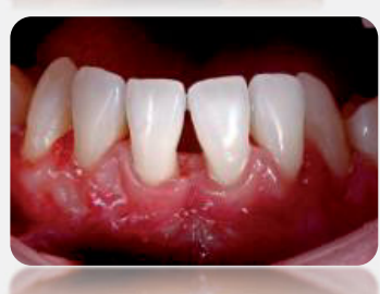
Fig. 10: Control 2 months