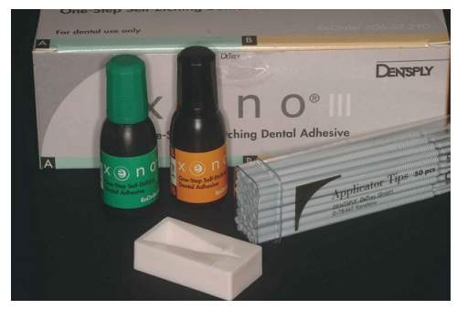
Fig. 4: The dentin adhesive system Xeno III used in this investigation.

Dentin specimens with a total thickness of 1.5 mm ( \pm 0.2 mm) were obtained under standardized conditions. All specimens were divided at random into four groups of fifteen each. In group A and B the new dentin adhesive system Xeno III was used in combination with the composite Esthet X and QuiXFil (Fig. 4, 7, 8), while group C and D served as control groups (Excite or Syntac in combination with Tetric Ceram)(Fig. 5, 6).