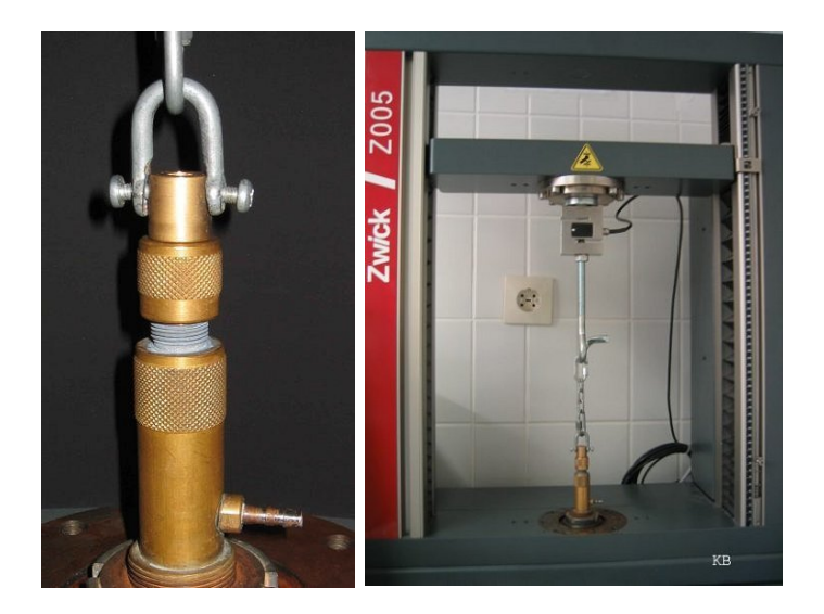
Fig. 2: Experimental device Fig. 3: Special designed apparatus with dentin sample inside mounted in the universal testing machine. before loading.

Dentin specimens with a total thickness of 1.5 mm ( \pm 0.2 mm) were obtained under standardized conditions. All specimens were divided at random into four groups of fifteen each. In group A and B the new dentin adhesive system Xeno III was used in combination with the composite Esthet X and QuiXFil (Fig. 4, 7, 8), while group C and D served as control groups (Excite or Syntac in combination with Tetric Ceram)(Fig. 5, 6).