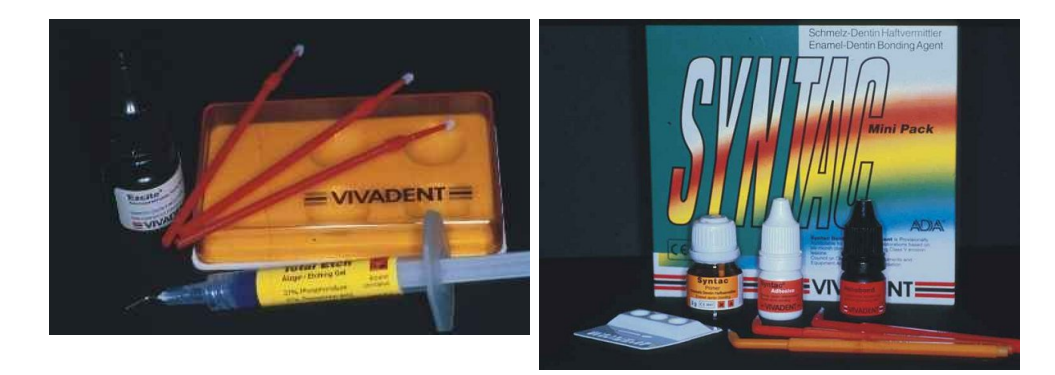
Fig. 5: The dentin adhesive system Excite used in this investigation.

Fig. 6: The dentin adhesive system Syntac used in this investigation.