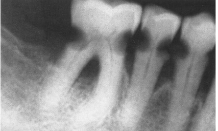
Fig. 2: Radiation caries. Radiograph taken ten weeks after radiation.