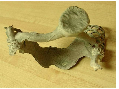
Fig. 2: Removable partial denture framework after deflasking