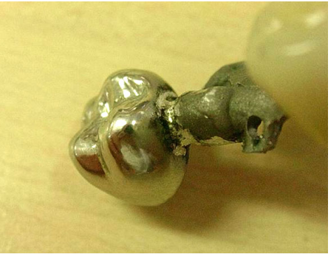
Fig. 4: Welding detail of telescopic crown to removable partial denture framework