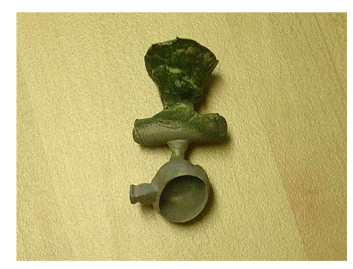
Fig. 1: Telescopic crown framework with medial extention for welding

Microplasma welding allow to combine telescopic crowns with other types of attachments through secondary crown welding with metallic saddle of removable partial dentures, separately cast (Fig. 1-4). This manouevre is necessary for achieving of a high precision joining which doesn't deform the shape and position of telescopic crown.