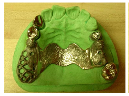
Fig. 3: Welded framework applies on the cast