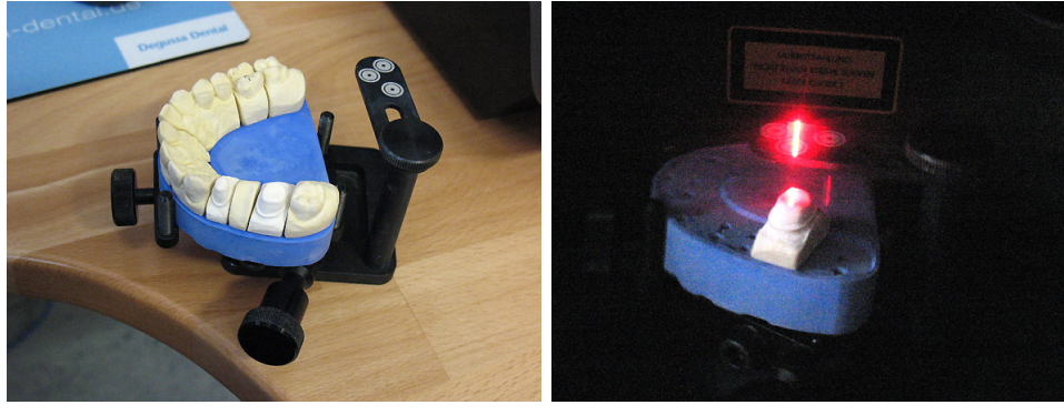
Fig. 1: Cast prepared for scanning

Data capture from models were made using an 3D laser scanner Cercon Eye with a precision down to the µm range (Fig. 1, 2). The scanner is an integrated part of the CAD/CAM system and operates only in combination with the dedicated soft Cercon art 2.2. It calculates the magnification factor and controls the conversion in the milling program. The virtual 3D dental restorations were designed on the computer screen following the specific steps. The CAD software transforms the virtual model into specific set of commands which drive the CAM unit. CAM complete oversized restorations were created by substraction from presintered soft prefabricated zirconium oxide blocks (Fig. 3, 4), processed and finally these were sintered and reduced to the original size (Fig. 5, 6, 7).