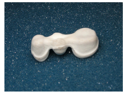
Fig. 7: Final sintered restoration