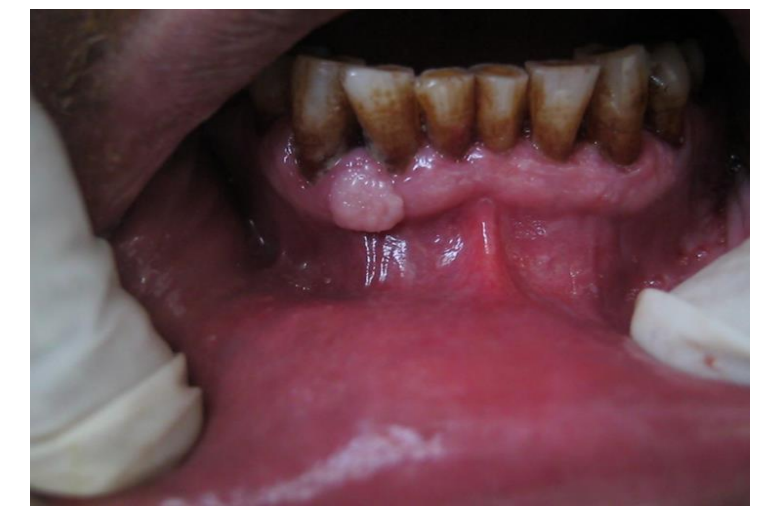
Figure 2: Gingival epulis