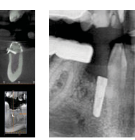
Figure 2: Defect size (horizontal and vertical deficit) obtaining a second-stage surgery including first augmentation with an individualized titanium lattice structure. Next step was removal of the mesh and implant placement.

Patients were tested bilaterally immediately or up to 8 month after implant exposure at the chin (extraoral) and the lower lip (intraoral). Mechanical and thermal sensation was evaluated. Additionally patients quality of life and mental state during the surgical procedures was assessed with the Oral Health Impact Profile (OHIP) and the Hospital Anxiety and Depression Scale (HADS).