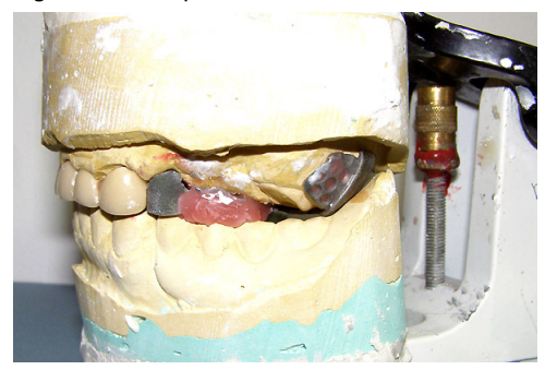
Fig. 3: case 3 photo 3