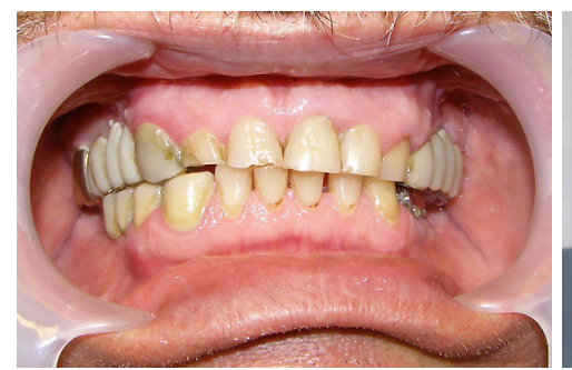
Fig. 1: case 3 photo 1

A lot of clinical cases are frequently solved giving priority to esthetics despite of the function, with good results but only on a short term. But what the majority of the patients want is a long-term successful prosthetic treatment, from both esthetic and functional criteria. The aim of this study was to explore the different methods and materials that can be used in order to fulfill their expectations.