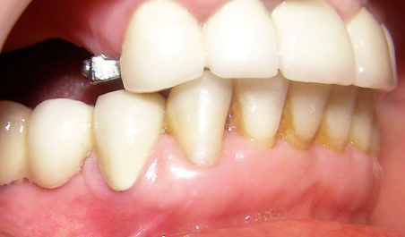
Fig. 12: case 4 photo 2