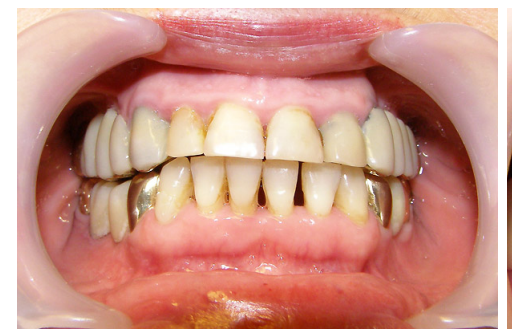
Fig. 11: case 4 photo 1