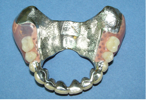
Fig. 6: case 3 photo 6