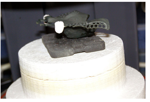
Fig. 4: case 3 photo 4