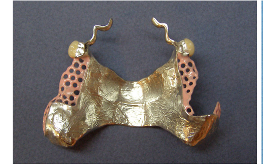
Fig. 5: case 3 photo 5