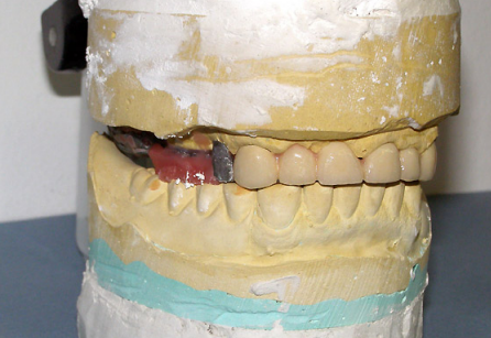
Fig. 2: case 3 photo 2